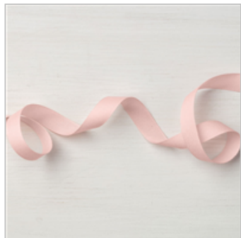
Powder Pink 1/2" Finely Woven Ribbon 144134