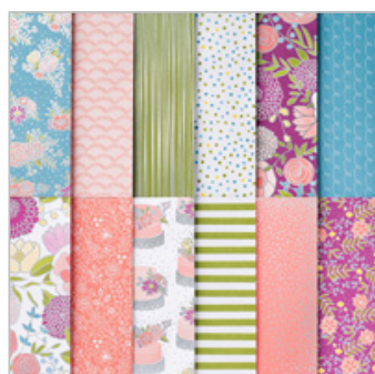
Sweet Soirée Specialty Designer Series Paper