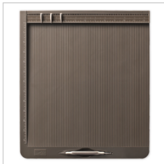
Simply Scored 122334