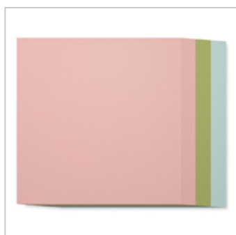
Subtles Best 12" X 12" Cardstock Pack