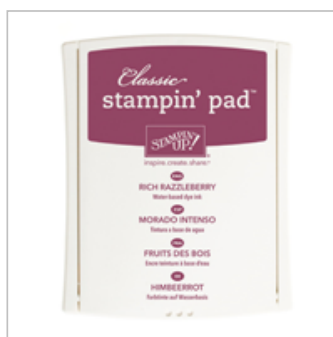
Rich Razzleberry Classic Stampin' Pad