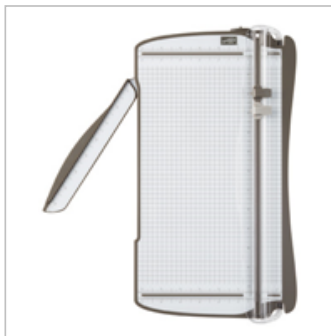
Stampin' Trimmer 126889