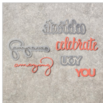
Celebrate You Thinlit Dies