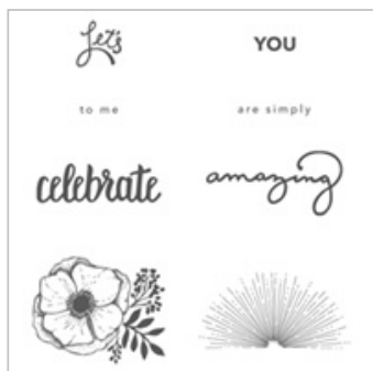
Amazing You Clear-Mount Stamp Set