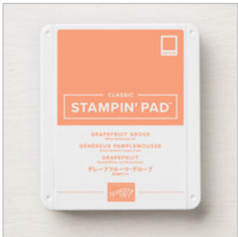
Grapefruit Grove Classic Stampin' Pad