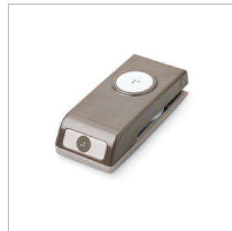
1" (2.5 Cm) Circle