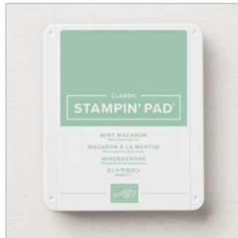
Mint Macaron Classic Stampin' Pad