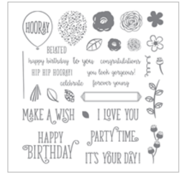
Happy Birthday Gorgeous Photopolymer Stamp Set