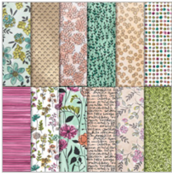
Share What You Love Specialty Designer Series Paper