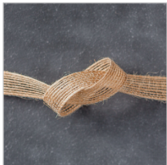
5/8" (1.6 Cm) Burlap