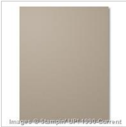
Tip Top Taupe 8-1/2" X 11" Cardstock - 138336