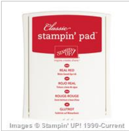
Real Red Classic Stampin' Pad - 126949