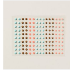
Opaque Faceted Gems - 162979