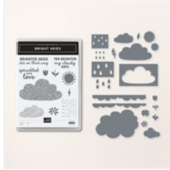
Bright Skies Bundle (English) - 162794