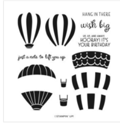
Hot Air Balloon Photopolymer Stamp Set (English) - 162748