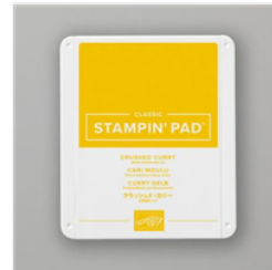
Crushed Curry Classic Stampin' Pad - 147087