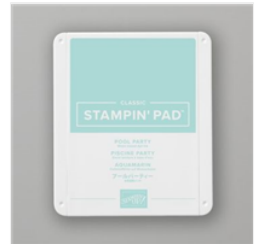
Pool Party Classic Stampin' Pad - 147107