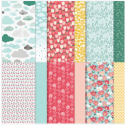
Sunny Days 12" X 12" (30.5 X 30.5 Cm) Designer Series Paper - 162974

inkybeestampers@gmail.com https://www.inkybeestampers.com