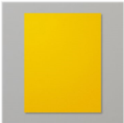
Crushed Curry 8- 1/2" X 11" Cardstock - 131199