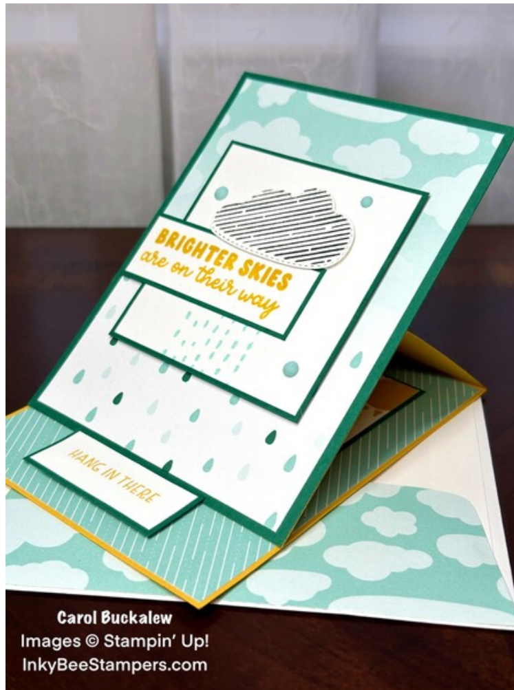
Carol Buckalew Images © Stampin' Up! InkyBeeStampers.com