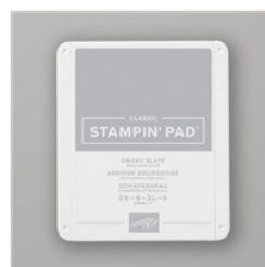
Smoky Slate Classic Stampin' Pad - 147113