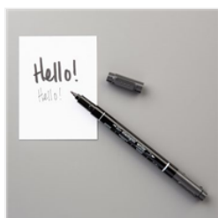
Basic Black Stampin' Write Marker - 100082