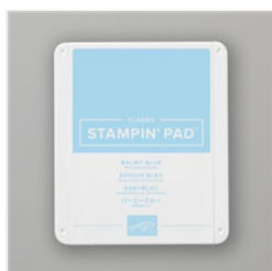
Balmy Blue Classic Stampin' Pad - 147105