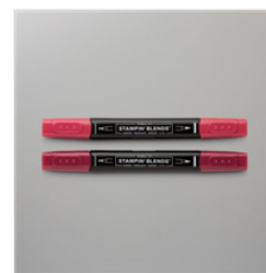
Cherry Cobbler Stampin' Blends Combo Pack - 154880