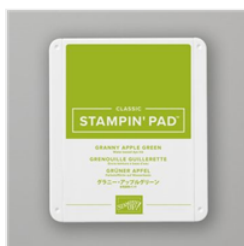
Granny Apple Green Classic Stampin' Pad - 147095