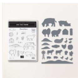
On The Farm Bundle (English) - 160661