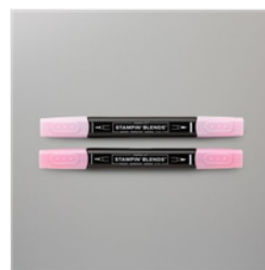
Flirty Flamingo Stampin' Blends Combo Pack - 154884