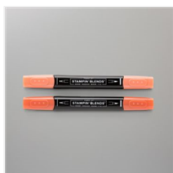
Cajun Craze Stampin' Blends Combo Pack - 154879