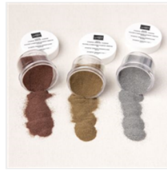
Metallics Embossing Powders - 155555