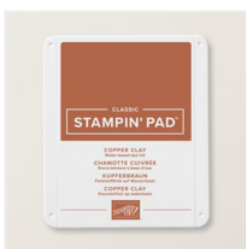
Copper Clay Classic Stampin' Pad - 161647