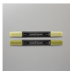
Old Olive Stampin' Blends Combo Pack - 154892