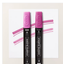
Berry Burst Stampin' Blends Combo Pack - 161681