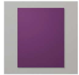
Blackberry Bliss 8- 1/2" X 11" Cardstock - 133675