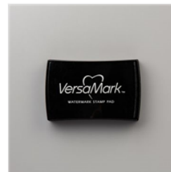
Versamark Pad - 102283