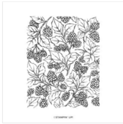
Berry Harvest Cling Stamp Set - 161272