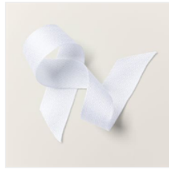
3/4" (1.9 Cm) Herringbone Ribbon - 161636