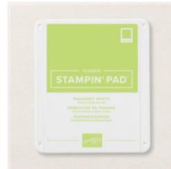
Parakeet Party Classic Stampin' Pad - 159208