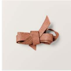
Copper Clay 3/8" (1 Cm) Textured Ribbon - 161629