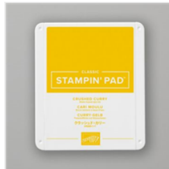
Crushed Curry Classic Stampin' Pad - 147087