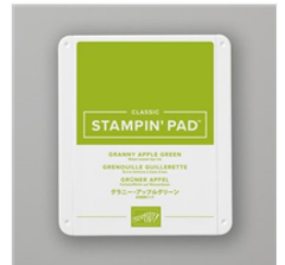
Granny Apple Green Classic Stampin' Pad - 147095