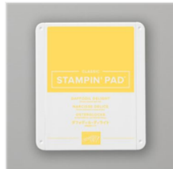
Daffodil Delight Classic Stampin' Pad - 147094