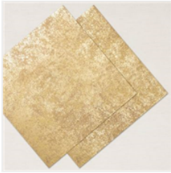
Distressed Gold 12" X 12" (30.5 X 30.5 Cm) Specialty Paper - 159237