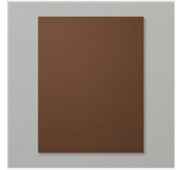
Early Espresso 8- 1/2" X 11" Cardstock - 119686