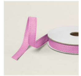
Petunia Pop 3/8" (1 Cm) Bordered Ribbon - 163785