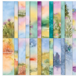
Thoughtful Journey 6" X 6" (15.2 X 15.2 Cm) Designer Series Paper - 163303