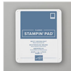
Misty Moonlight Classic Stampin' Pad - 153118