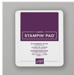
Blackberry Bliss Classic Stampin' Pad - 147092