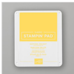
Daffodil Delight Classic Stampin' Pad - 147094