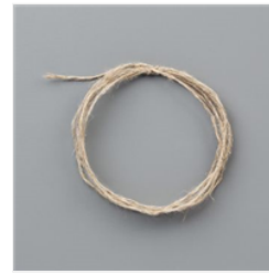
Linen Thread - 104199