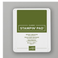
Mossy Meadow Classic Stampin' Pad - 147111