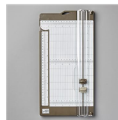
Paper Trimmer - 152392