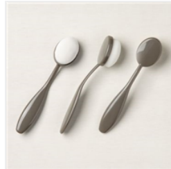
Blending Brushes - 153611