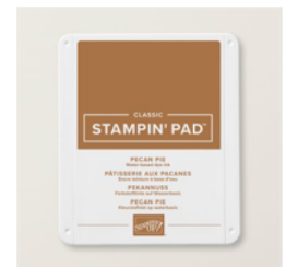
Pecan Pie Classic Stampin' Pad - 161665