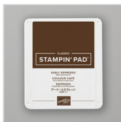
Early Espresso Classic Stampin' Pad - 147114