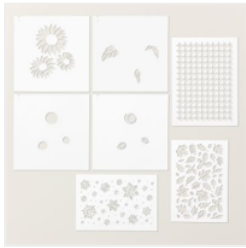
Abundant Beauty Decorative Masks - 162331