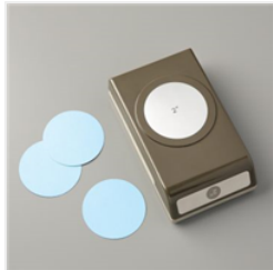
2" (5.1 Cm) Circle Punch - 133782