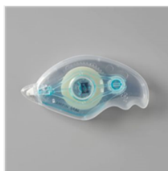
Stampin' Seal - 152813