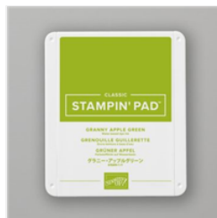
Granny Apple Green Classic Stampin' Pad - 147095