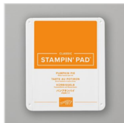
Pumpkin Pie Classic Stampin' Pad - 147086