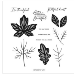
Autumn Leaves Photopolymer Stamp Set (English) - 162179