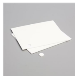
Stampin' Dimensionals - 104430