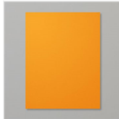
Pumpkin Pie 8-1/2" X 11" Cardstock - 105117