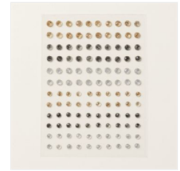
Adhesive-Backed Sparkle Gems - 161288