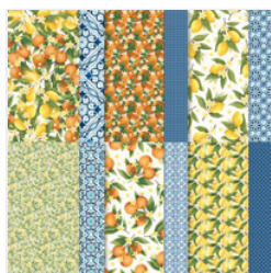
Mediterranean Blooms 12" X 12" (30.5 X 30.5 Cm) Designer Series Paper - 163284