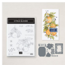
Citrus Blooms Bundle (English) - 163295