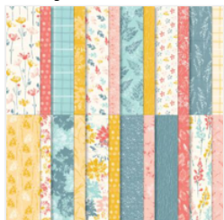
Inked Botanicals 6" X 6" (15.2 X 15.2 Cm) Designer Series Paper - 161157