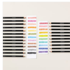
Watercolor Pencils Assortment 1 - 161700