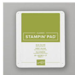
Old Olive Classic Stampin' Pad - 147090