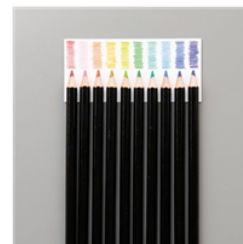
Watercolor Pencils Assortment 2 - 149014