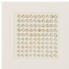
Iridescent Foil Gems - 162842