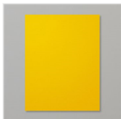
Crushed Curry 8-1/2" X 11" Cardstock - 131199