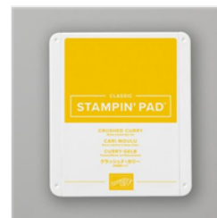
Crushed Curry Classic Stampin' Pad - 147087