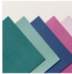
Soft Shimmer 12" X 12" (30.5 X 30.5 Cm) Specialty Paper - 161750