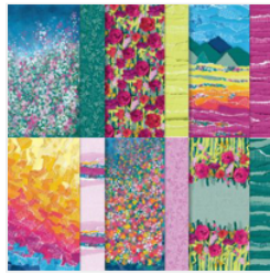
Masterfully Made 12" X 12" (30.5 X 30.5 Cm) Designer Series Paper - 161192