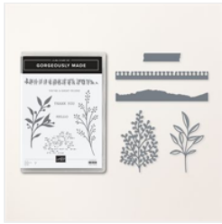
Gorgeously Made Bundle (English) - 161203