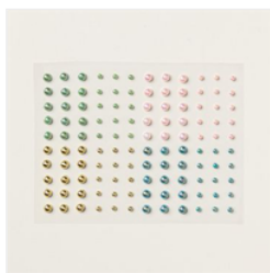
Blooming Pearls - 162238 Price: $8.00