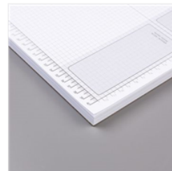
Grid Paper - 130148