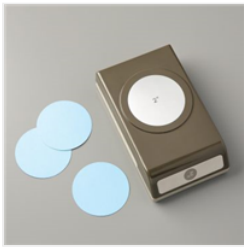
2" (5.1 Cm) Circle Punch - 133782