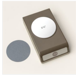
2-3/8" (6 Cm) Circle Punch - 161354