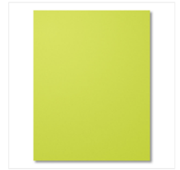
Lemon Lime Twist 8-1/2" X 11" Cardstock - 144245