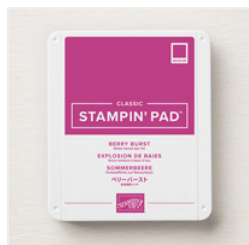
Berry Burst Classic Stampin' Pad - 147143