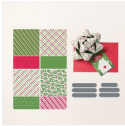
Take A Bow Bundle - 165129