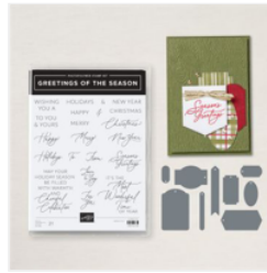
Greetings Of The Season Bundle (English) - 164113