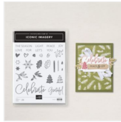
Iconic Imagery Photopolymer Stamp Set (English) - 164194