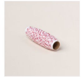
Real Red & White Baker's Twine - 164051