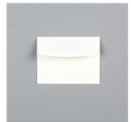
Very Vanilla Medium Envelopes - 107300