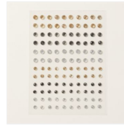
Adhesive-Backed Sparkle Gems - 161288