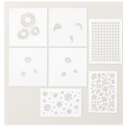
Abundant Beauty Decorative Masks - 162331