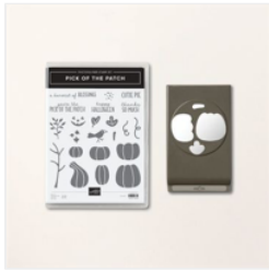
Pick Of The Patch Bundle (English) - 162201