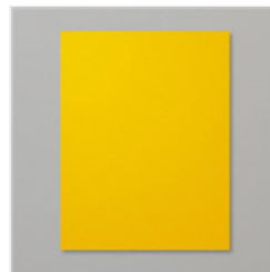
Crushed Curry 8- 1/2" X 11" Cardstock - 131199