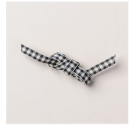
Black & Very Vanilla 3/8" (1 Cm) Large Check Ribbon - 161982