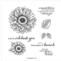
Celebrate Sunflowers Cling Stamp Set (English) - 152517