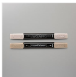
Crumb Cake Stampin' Blends Combo Pack - 154882