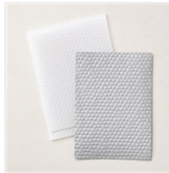
Hive 3D Embossing Folder - 157955