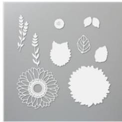
Sunflowers Dies - 152704