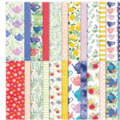
Tea Boutique 6" X 6" (15.2 X 15.2 Cm) Designer Series Paper - 158659