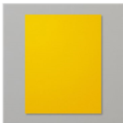
Crushed Curry 8- 1/2" X 11" Cardstock - 131199