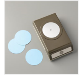
2" (5.1 Cm) Circle Punch - 133782