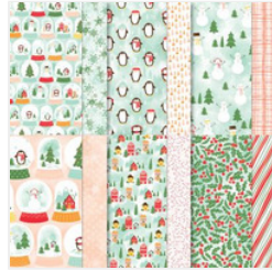
Snowy Scenes 12" X 12" (30.5 X 30.5 Cm) Designer Series Paper - 164333