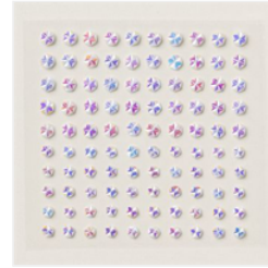
Iridescent Faceted Gems - 163368