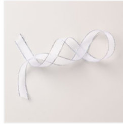
Silver & White 1/2" (1.3 Cm) Sheer Ribbon - 162149