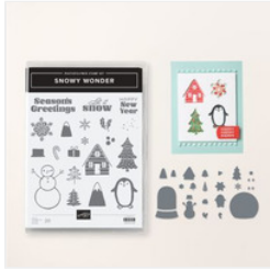
Snowy Wonder Bundle (English) - 164125

inkybeestampers@gmail.com https://www.inkybeestampers.com