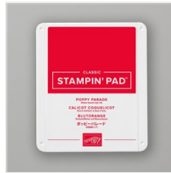
Poppy Parade Classic Stampin' Pad - 147050