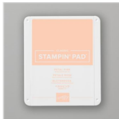
Petal Pink Classic Stampin' Pad - 147108