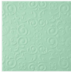
Parisian Flourish 3D Embossing Folder - 151474