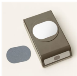
Modern Oval Punch - 162234