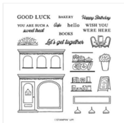
Let's Go Shopping Photopolymer Stamp Set (English) - 161777