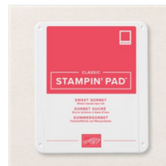
Sweet Sorbet Classic Stampin' Pad - 159216