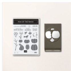
Pick Of The Patch Bundle (English) - 162201