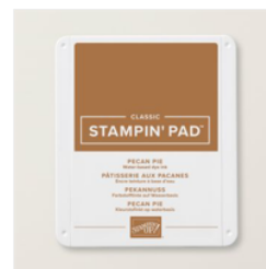
Pecan Pie Classic Stampin' Pad - 161665