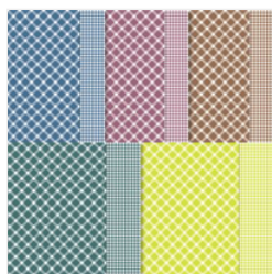
Glorious Gingham 6" X 6" (15.2 X 15.2 Cm) Designer Series Paper - 163170