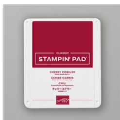
Cherry Cobbler Classic Stampin' Pad - 147083