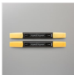
Daffodil Delight Stampin' Blends Combo Pack - 154883