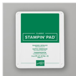
Shaded Spruce Classic Stampin' Pad - 147088