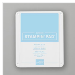
Balmy Blue Classic Stampin' Pad - 147105