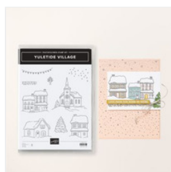
Yuletide Village Photopolymer Stamp Set - 164310