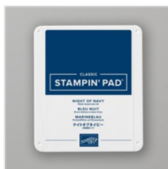
Night Of Navy Classic Stampin' Pad - 147110