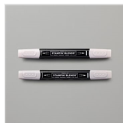
Gray Granite Stampin' Blends Combo Pack - 154886