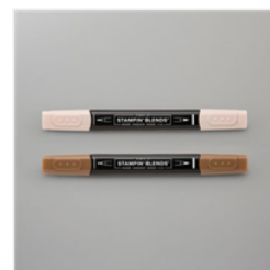
Bronze & Ivory Stampin' Blends Combo Pack - 154922