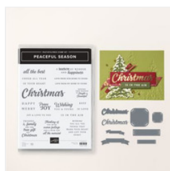
Peaceful Season Bundle (English) - 164021