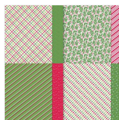
Take A Bow 6" X 6" (15.2 X 15.2 Cm) Designer Series Paper - 164309