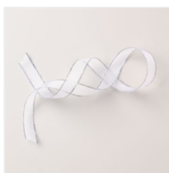
Silver & White 1/2" (1.3 Cm) Sheer Ribbon - 162149