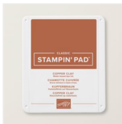
Copper Clay Classic Stampin' Pad - 161647