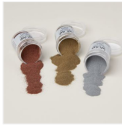
Metallics Wow! Embossing Powder - 165678