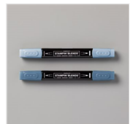
Misty Moonlight Stampin' Blends Combo Pack - 153108