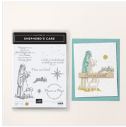
Shepherd's Care Cling Stamp Set (English) - 164300