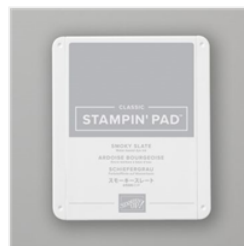
Smoky Slate Classic Stampin' Pad - 147113