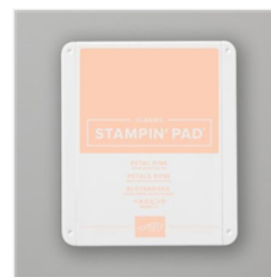
Petal Pink Classic Stampin' Pad - 147108