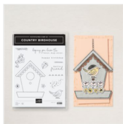
Country Birdhouse Photopolymer Stamp Set (English) - 163395