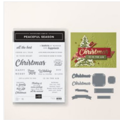
Peaceful Season Bundle (English) - 164021