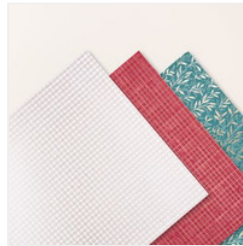
Regal Distressed Patterns 12" X 12" (30.5 X 30.5 Cm) Specialty Designer Series Paper - 164037