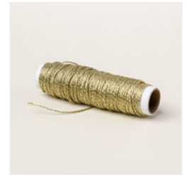
Gold Twisted Thread - 164603