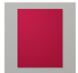
Cherry Cobbler 8-1/2" X 11" Cardstock - 119685