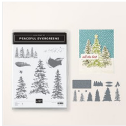
Peaceful Evergreens Bundle - 164025

inkybeestampers@gmail.com https://www.inkybeestampers.com