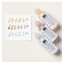
Metallic Enamel Effects Basics - 161610