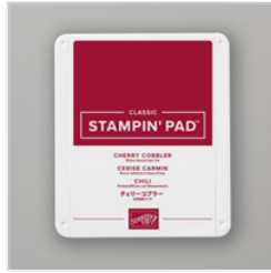
Cherry Cobbler Classic Stampin' Pad - 147083