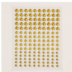
Gold Textured Adhesive-Backed Dots - 164027