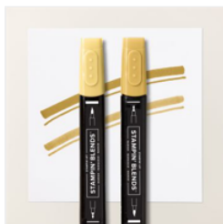
Wild Wheat Stampin' Blends Combo Pack - 161661