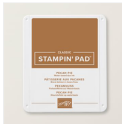
Pecan Pie Classic Stampin' Pad - 161665