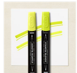
Parakeet Party Stampin' Blends Combo Pack - 159220