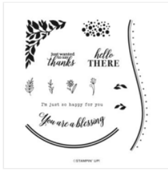
Around The Bend Photopolymer Stamp Set (English) - 160648