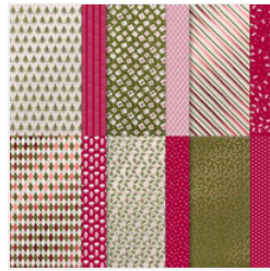
Shining Christmas 12" X 12" (30.5 X 30.5 Cm) Specialty Designer Series Paper - 162354