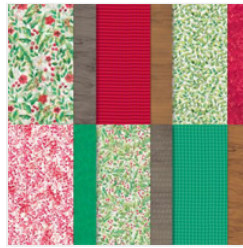
Joy Of Christmas 12" X 12" (30.5 X 30.5 Cm) Designer Series Paper - 161958