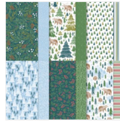
A Walk In The Forest 12" X 12" (30.5 X 30.5 Cm) Designer Series Paper - 162377