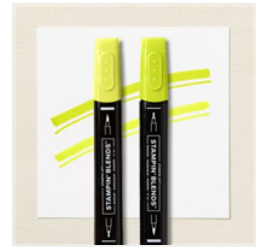
Parakeet Party Stampin' Blends Combo Pack - 159220