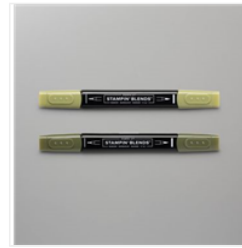
Mossy Meadow Stampin' Blends Combo Pack - 154890