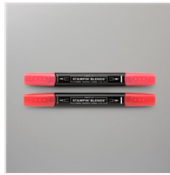
Poppy Parade Stampin' Blends Combo Pack - 154958