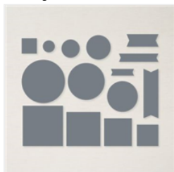
Stylish Shapes Dies - 159183