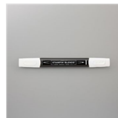
Stampin' Blends Color Lifter - 144608