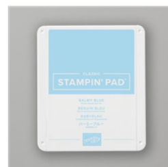
Balmy Blue Classic Stampin' Pad - 147105