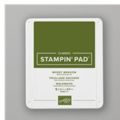
Mossy Meadow Classic Stampin' Pad - 147111