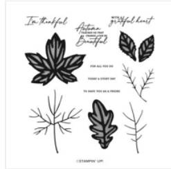
Autumn Leaves Photopolymer Stamp Set (English) - 162179