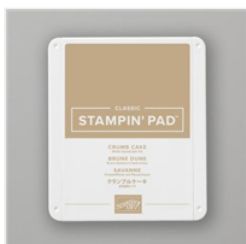
Crumb Cake Classic Stampin' Pad - 147116