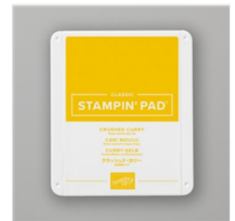
Crushed Curry Classic Stampin' Pad - 147087