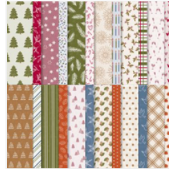
Iconic Celebrations 6" X 6" (15.2 X 15.2 Cm) Designer Series Paper - 164193