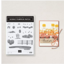
Scenic Pumpkin Patch Photopolymer Stamp Set (English) - 164364

inkybeestampers@gmail.com https://www.inkybeestampers.com