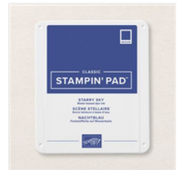
Starry Sky Classic Stampin' Pad - 159212