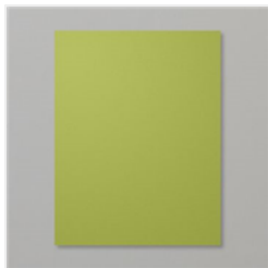
Old Olive 8-1/2" X 11" Cardstock - 100702