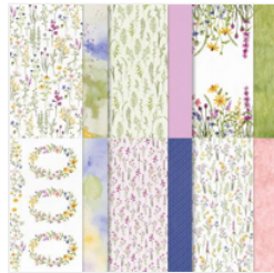
Dainty Flowers 12" X 12" (30.5 X 30.5 Cm) Designer Series Paper - 160834