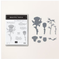
Beautiful Thistle Bundle (English) - 160682

inkybeestampers@gmail.com https://www.inkybeestampers.com