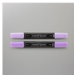
Highland Heather Stampin' Blends Combo Pack - 154887