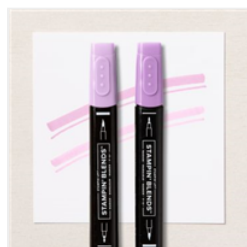
Fresh Freesia Stampin' Blends Combo Pack - 155518