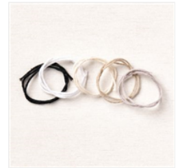
Baker's Twine Essentials Pack - 155475