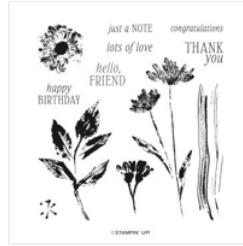
Inked & Tiled Cling Stamp Set (English) - 161158