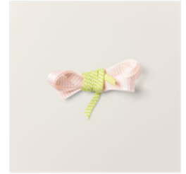
Ribbon Duo Combo Pack - 161318