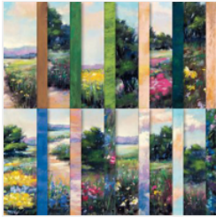
Meandering Meadows 6" X 6" (15.2 X 15.2 Cm) Designer Series Paper - 162735

inkybeestampers@gmail.com https://www.inkybeestampers.com