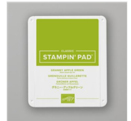
Granny Apple Green Classic Stampin' Pad - 147095