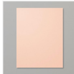
Petal Pink 8-1/2" X 11" Cardstock - 146985