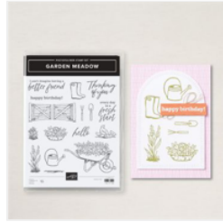
Garden Meadow Photopolymer Stamp Set (English) - 162736