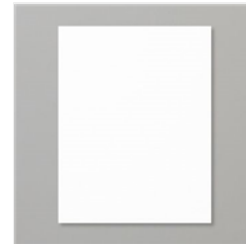
Basic White 8-1/2" X 11" Cardstock - 159276