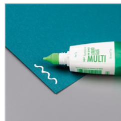
Multipurpose Liquid Glue - 110755