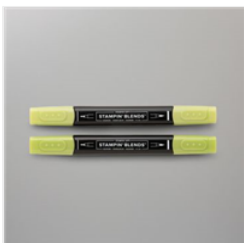
Granny Apple Green Stampin' Blends Combo Pack - 154885