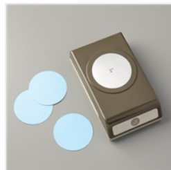
2" (5.1 Cm) Circle Punch - 133782