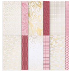
Most Adored 12" X 12" (30.5 X 30.5 Cm) Specialty Designer Series Paper - 162976