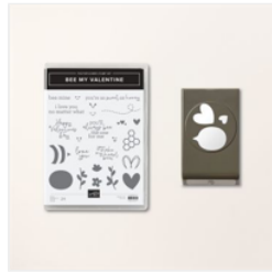
Bee My Valentine Bundle (English) - 162554