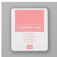
Flirty Flamingo Classic Stampin' Pad - 147052