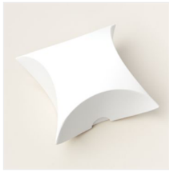
Square Pillow Boxes - 162559