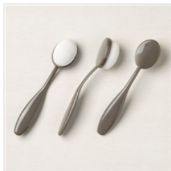
Blending Brushes - 153611