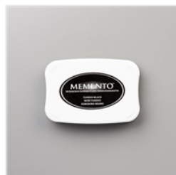
Tuxedo Black Memento Ink Pad - 132708