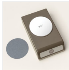
2-3/8" (6 Cm) Circle Punch - 161354