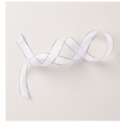
Silver & White 1/2" (1.3 Cm) Sheer Ribbon - 162149