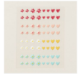
Adhesive-Backed Hearts & Flowers - 162557