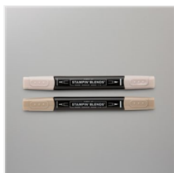
Crumb Cake Stampin' Blends Combo Pack - 154882