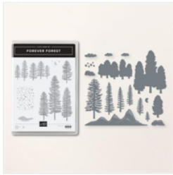
Forever Forest Bundle - 162058