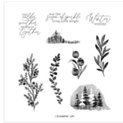
Magical Meadow Cling Stamp Set (English) - 162134