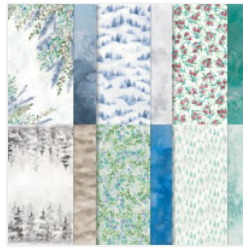
Winter Meadow 12" X 12" (30.5 X 30.5 Cm) Designer Series Paper - 162133