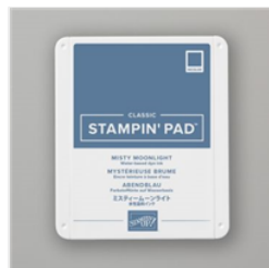
Misty Moonlight Classic Stampin' Pad - 153118