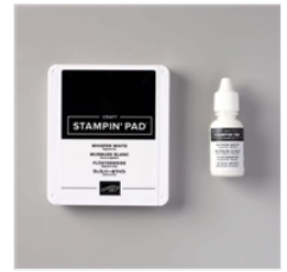
Unlinked Stampin' Pad & Whisper White Refill - 147277