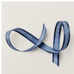
Night Of Navy 3/8" (1 Cm) Bordered Ribbon - 160581