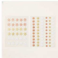
Adhesive-Backed Snowflake Assortment - 162129