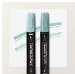
Lost Lagoon Stampin' Blends Combo Pack - 161680