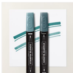
Pretty Peacock Stampin' Blends Combo Pack - 161676