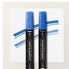
Blueberry Bushel Stampin' Blends Combo Pack - 161679