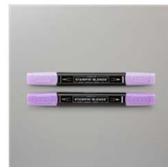
Highland Heather Stampin' Blends Combo Pack - 154887