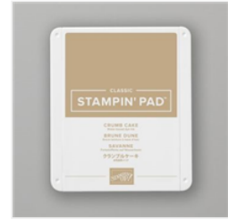
Crumb Cake Classic Stampin' Pad - 147116