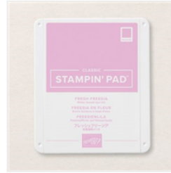
Fresh Freesia Classic Stampin' Pad - 155611