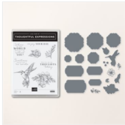
Thoughtful Expressions Bundle (English) - 162822

inkybeestampers@gmail.com https://www.inkybeestampers.com