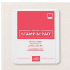
Sweet Sorbet Classic Stampin' Pad - 159216