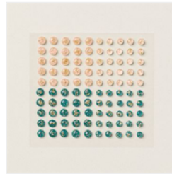
Petal Pink & Pretty Peacock Foiled Gems - 162587