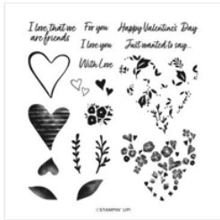
Country Bouquet Photopolymer Stamp Set (English) - 160377