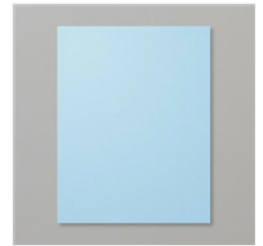
Balmy Blue 8-1/2" X 11" Cardstock - 146982