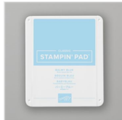
Balmy Blue Classic Stampin' Pad - 147105