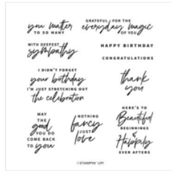
Something Fancy Cling Stamp Set (English) - 160416