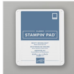
Misty Moonlight Classic Stampin' Pad - 153118