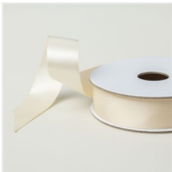
Very Vanilla 3/4" (1.9 Cm) Satin Ribbon - 164120