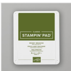
Mossy Meadow Classic Stampin' Pad - 147111