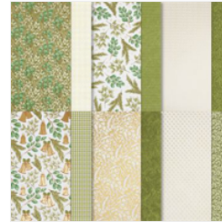
Season Of Green & Gold 12" X 12" (30.5 X 30.5 Cm) Specialty Designer Series Paper - 164324