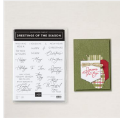
Greetings Of The Season Photopolymer Stamp Set (English) - 164325