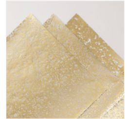
Gold Mercury Vellum 12" X 12" (30.5 X 30.5 Cm) Specialty Designer Series Paper - 164142