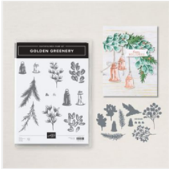
Golden Greenery Bundle - 164117

inkybeestampers@gmail.com https://www.inkybeestampers.com