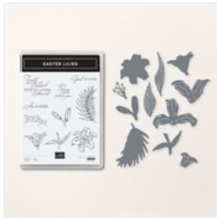
Easter Lilies Bundle (English) - 162786