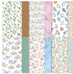
Flight & Airy 12" X 12" (30.5 X 30.5 Cm) Designer Series Paper - 162977