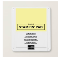
Lemon Lolly Classic Stampin' Pad - 161666