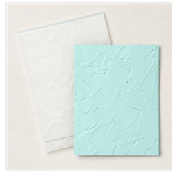
Painted Texture 3D Embossing Folder - 154317