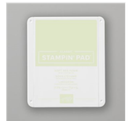
Soft Sea Foam Classic Stampin' Pad - 147102