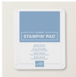
Boho Blue Classic Stampin' Pad - 161650