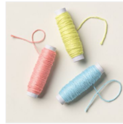
Baker's Twine Three Color Pack - 162759