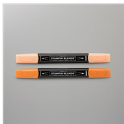
Pumpkin Pie Stampin' Blends Combo Pack - 154897