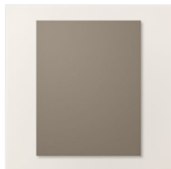
Pebbled Path 8- 1/2" X 11" Cardstock - 161722