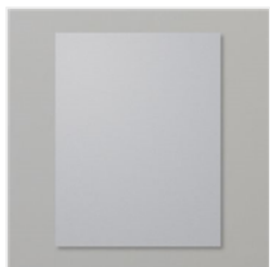
Smoky Slate 8-1/2" X 11" Cardstock - 131202