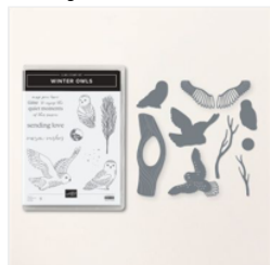
Winter Owls Bundle Bundle (English) - 162157

inkybeestampers@gmail.com https://www.inkybeestampers.com