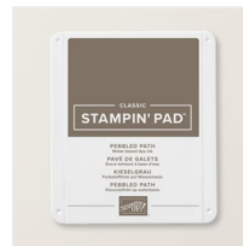
Pebbled Path Classic Stampin' Pad - 161648