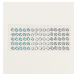
Faceted Gems Trio Pack - 162148