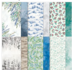
Winter Meadow 12" X 12" (30.5 X 30.5 Cm) Designer Series Paper - 162133