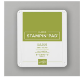
Old Olive Classic Stampin' Pad - 147090