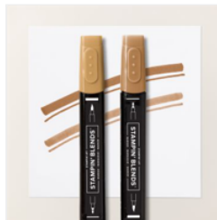
Pecan Pie Stampin' Blends Combo Pack - 161674