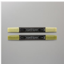
Old Olive Stampin' Blends Combo Pack - 154892