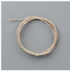
Linen Thread - 104199