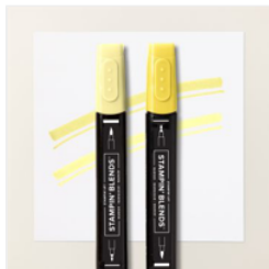
Lemon Lolly Stampin' Blends Combo Pack - 161673