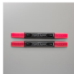
Real Red Stampin' Blends Combo Pack - 154899