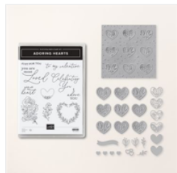
Adoring Hearts Bundle (English) - 162570