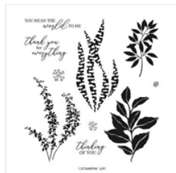
Botanical Layers Cling Stamp Set (English) - 158912