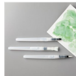
Water Painters - 151298