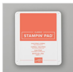
Calypso Coral Classic Stampin' Pad - 147101