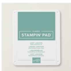
Lost Lagoon Classic Stampin' Pad - 161678