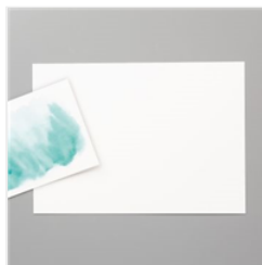
Fluid 100 Watercolor Paper - 149612