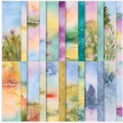
Thoughtful Journey 6" X 6" (15.2 X 15.2 Cm) Designer Series Paper - 163303

inkybeestampers@gmail.com https://www.inkybeestampers.com