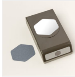
Heartfelt Hexagon Punch - 162888