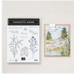
Thoughtful Wishes Cling Stamp Set (English) - 163305