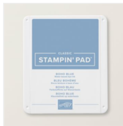
Boho Blue Classic Stampin' Pad - 161650