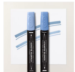
Boho Blue Stampin' Blends Combo Pack - 161659