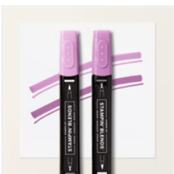
Petunia Pop Stampin' Blends Combo Pack - 163828