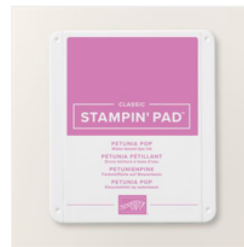
Petunia Pop Classic Stampin' Pad - 163811