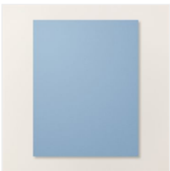
Boho Blue 8-1/2" X 11" Cardstock - 161724