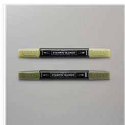
Mossy Meadow Stampin' Blends Combo Pack - 154890