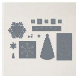
Twinkling Lights Dies - 159541