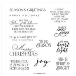
Brightest Glow Cling Stamp Set (English) - 159542