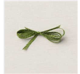
Parakeet Party 1/8" (3.2 Mm) Metallic Woven Ribbon - 159196