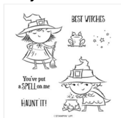
Best Witches Cling Stamp Set (English) - 159860