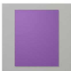
Gorgeous Grape 8-1/2" X 11" Cardstock - 146987