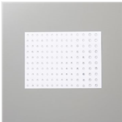
Rhinestone Basic Jewels - 144220