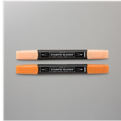
Pumpkin Pie Stampin' Blends Combo Pack - 154897