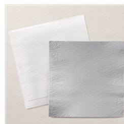
Timber 3D Embossing Folder - 156406