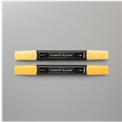
Daffodil Delight Stampin' Blends Combo Pack - 154883

inkybeestampers@gmail.com https://www.inkybeestampers.com