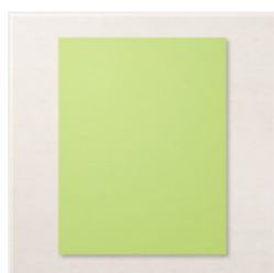
Parakeet Party 8-1/2" X 11" Cardstock - 159259