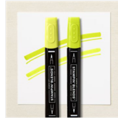
Parakeet Party Stampin' Blends Combo Pack - 159220