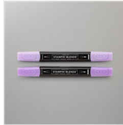
Highland Heather Stampin' Blends Combo Pack - 154887