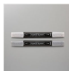
Smoky Slate Stampin' Blends Combo Pack - 154904