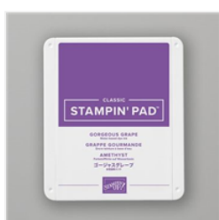
Gorgeous Grape Classic Stampin' Pad - 147099