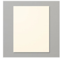
Very Vanilla 8-1/2" X 11" Cardstock - 101650