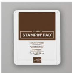
Early Espresso Classic Stampin' Pad - 147114