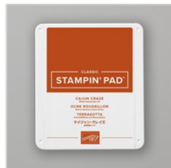
Cajun Craze Classic Stampin' Pad - 147085