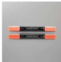
Cajun Craze Stampin' Blends Combo Pack - 154879