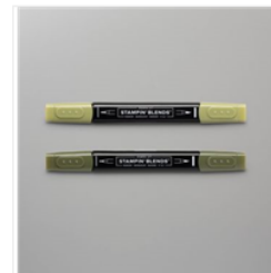
Mossy Meadow Stampin' Blends Combo Pack - 154890