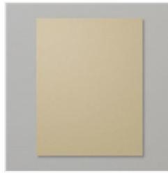
Crumb Cake 8-1/2" X 11" Cardstock - 120953