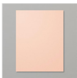
Petal Pink 8-1/2" X 11" Cardstock - 146985